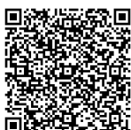
Registrar Pharmacy Council